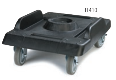
4 rotating wheels give this dolly unmatched maneuverability