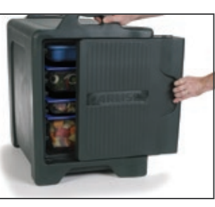
Sliding doors easily open and close for quick access and transport

*Slide 'N Seal Patents Pan Carriers: Patent No. 7,134,552